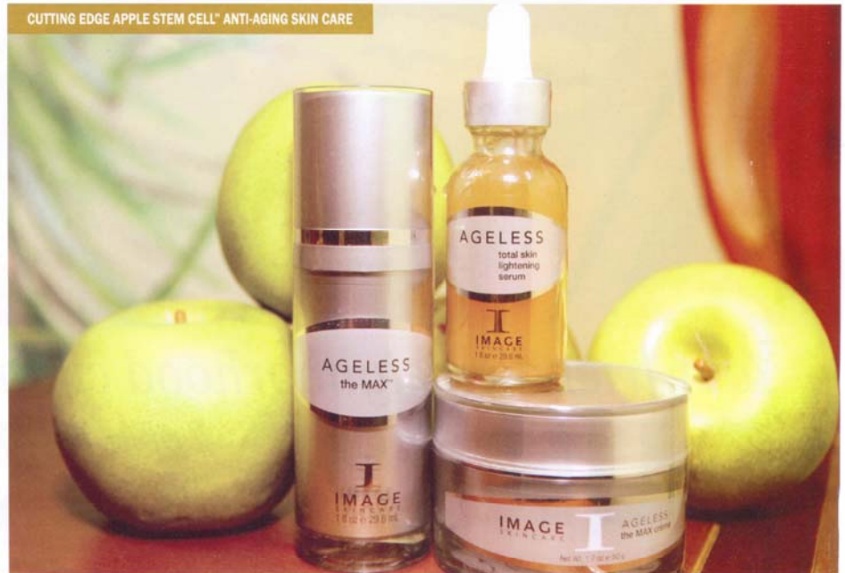
CUTTING EDGE APPLE STEM CELL® ANTI-AGING SKIN CARE