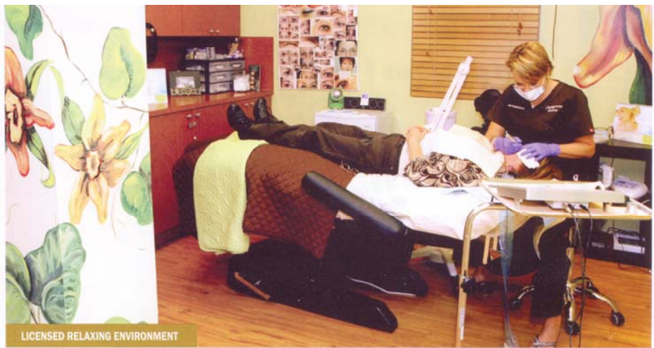
LICENSED RELAXING ENVIRONMENT

If you listen to those around town who have experienced her work, you will see for yourself how permanent make-up can transform you. "Before permanent makeup I was vanilla. Thank you for making me